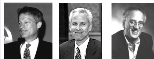
Panelists for the Williams Club Fall Forum.

The Williams Club is proud to host an engaging, unique event this November on a