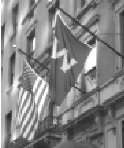
Reclaiming the W for 39th Street. What's old in new again as we hoist a new version of the flag.